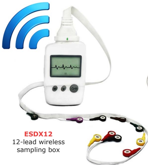
ESDX12 12-lead wireless sampling box

ESSE-1515 PC ECG provides you comprehensive ECG solutions, which integrates resting ECG, stress ECG and data management in one PC-based software. Its user-friendly interfaces and reliable interpretation helps increase patient throughput and improve clinicians' efficiency. With latest ESSE15 sampling box, clinicians are able to do standard 12 -lead ECG tests, and also easily upgrade the tests into 15/16-lead only by adding 4 separated lead