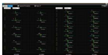
ECG Templates Comparison

Standard and unlimited user-defined protocols are offered, facilitating your standard or customized stress tests.