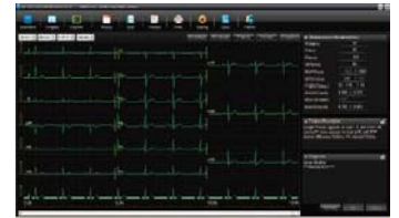
Proof for Diagnosis