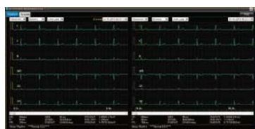
ECG Reports Comparison

Clinicians are allowed to retrieve the historic reports and compare them with the current ones when they are doing analysis.