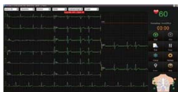
ECG Signal Quality Indicator

One-touch button on the sampling box enables to start or stop ECG acquisition without going to PC side.