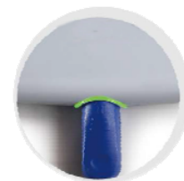
ECG Signal Quality Indicator

Quickly identify the poor or missing ECG signals by visual color-coded indicators.