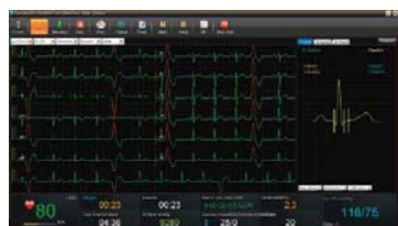
Auto Arrhythmia Detection

The DE1 5 sampling box offers 4 additional leads which are specialized for the right side chest leads (V3R, V4R, V5R) or posterior leads (V7, V8, V9) to facilitate 15/16-lead ECG acquisition.