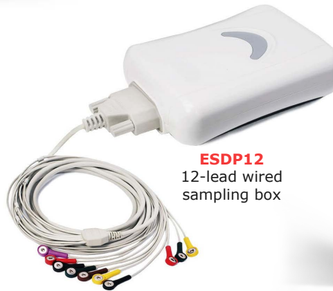
ESDP12 12-lead wired sampling box